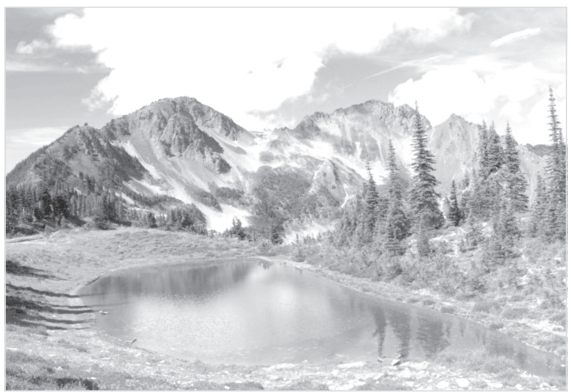
Mount Appleton and Oyster Lake.